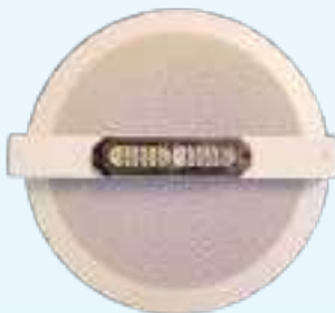
Paging and Alerting