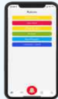
SA-Inform Phone Application