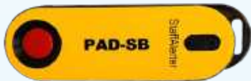
Personal Alerting Device

Nothing stands in your way of making your facility safer now with StaffAlerter, the best command and control emergency notification and response technology on the market.