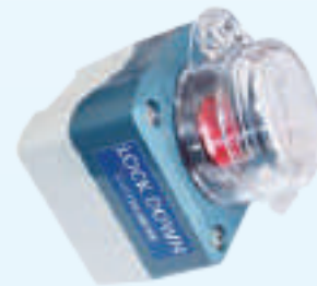
Push Button Alert

Call or Email for a Free Consultation or Quote